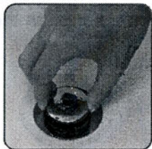
pic 2 way of drainer cover

When the drainer is choked by something else, turn it to a counterclockwise direction, then take the drainer cover and clean it. (See pig 2)