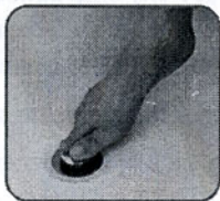
pic 1 way of drainer

Step on the drainer directly, then the cover will jump automatically, then the water can go down smoothly. (See pig 1)